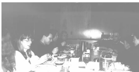
Board members enjoy a casual meal prior to taking up the business of running the theatre.

A smaller number of TAS members also visited the Lewiston Civic Theatre on February 11 to see a matinee performance of 'Silver Wings on Blue',